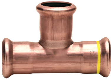
T-Stück I/I aus Kupfer.